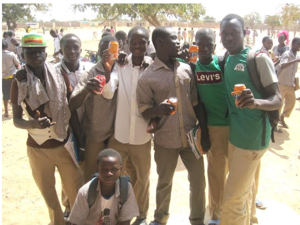
A group of students from College Ezra.