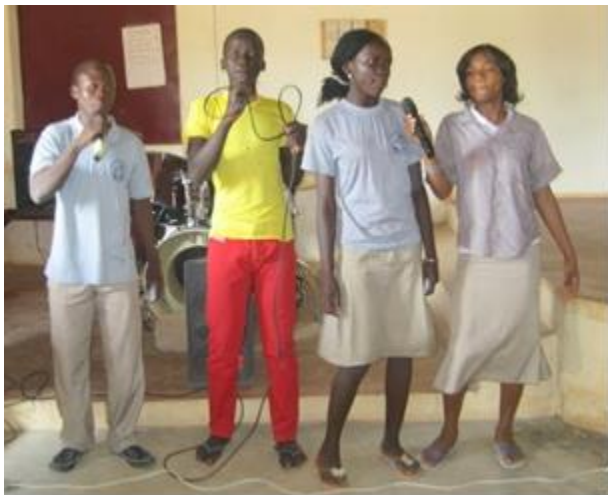
One of the student worship teams